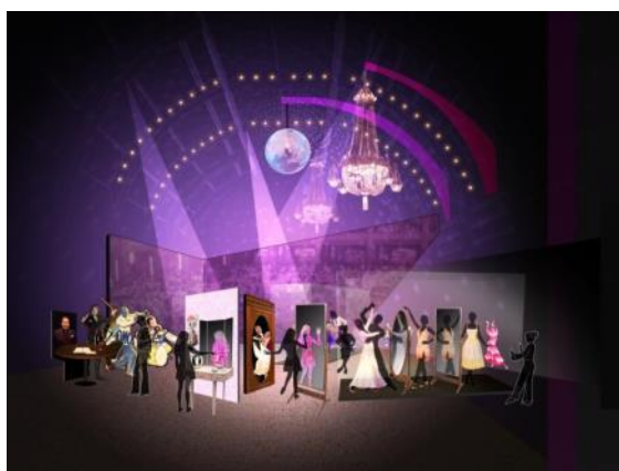
Visual of Everybody dance now © Casson Mann