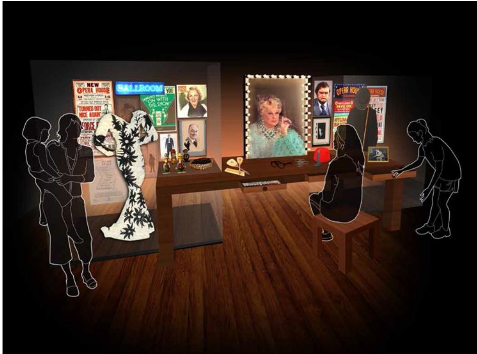
Visual of 'Getting into character' interactive, part of It's show time!