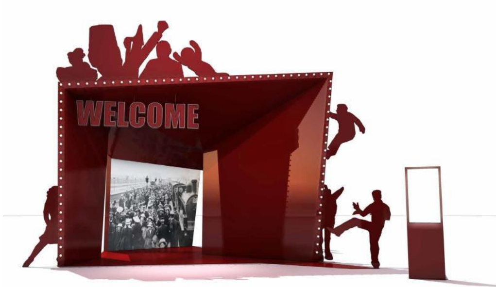
Museum entrance visual © Casson Mann