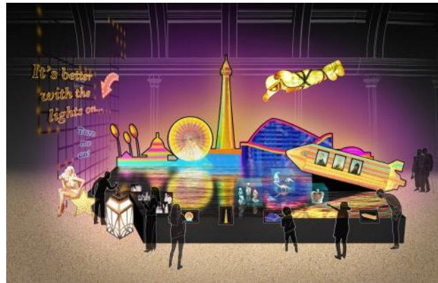
Visual of It's better with the lights on © Casson Mann

The shining light at the end of the Museum visit, learn why Blackpool is a pioneer in electric lighting, travel down the promenade through the Lights in an illuminated tram, create your own illumination and throw the switch to light up the displays.