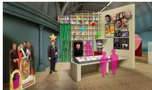
Visual of 'House of secrets', part of How bizarre

Capturing the sights and sounds from the Golden Mile; visit magic shops and learn a trick or two, interact with a 100 year old gazing ball and have your fortune told, see if you can squeeze into Houdini's milk churn, and sneak a peek at a bearded lady.