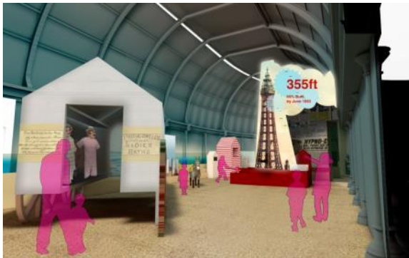
Visual of Horseshoe looking towards Reach for the sky © Casson Mann