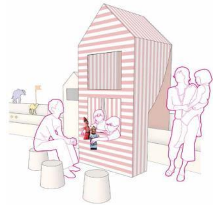
Visual of Museum Punch and Judy interactive

The story of how Blackpool became symbolic of the British seaside holiday both at home and abroad. Race your donkey against an elephant and a camel in a Donkey Derby, perform your very own Punch and Judy show, see the different beach fashions worn in Blackpool over the years and identify the smells of various food stuffs sold on the beach.