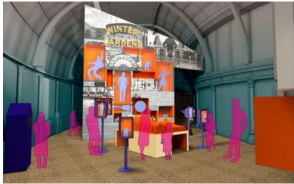
Visual of Let us entertain you