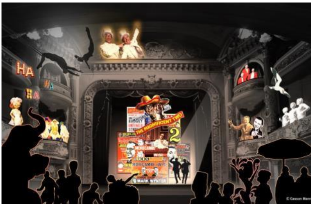
Visual of It's show time! with show taking place